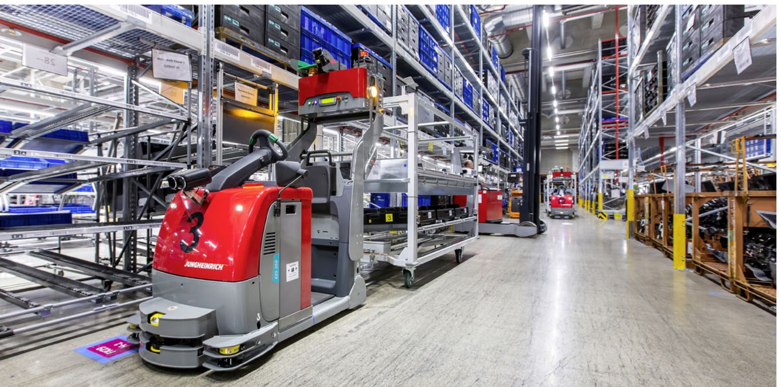
Logistics Hall and Pre-Assembly Center (Hall B) at Güterverkehrszentrum (GVZ = Freight Center) Ingolstadt

In 2018, Audi and FIS created the initial bases for integrating artificial intelligence into the invoice receipt monitor. For EDI invoices, the data that only exists in the original EDI data record will be passed on to the SAP back end to ensure that the AI engine has a data basis it can interpret and learn from. So